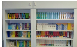
Video and Audio Tapes