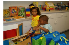
Children playing with some newly purchased equip- ment for our Library.