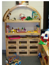
Toys for children